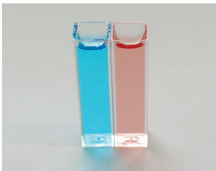
Figure 2: Color shift caused by dye conjugation.

The CE Dye labeling process is simple to perform with completion of the reaction observed by a color change from blue to red.