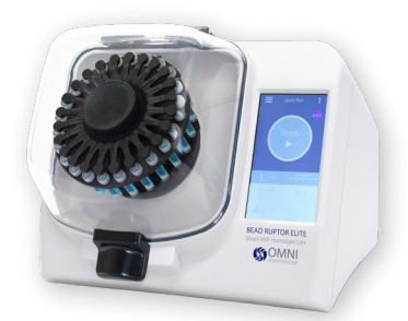
Bead Ruptor Elite™ Bead Mill Homogenizer

For research use only. Not for use in diagnostic procedures.